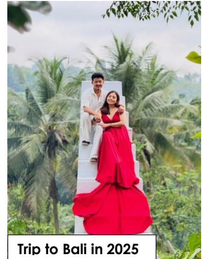
Trip to Bali in 2025