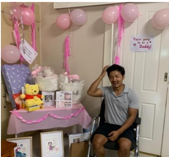
Baby morning Tea with the Team @Westlakes