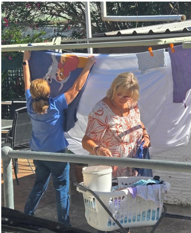
TP teaching me how to hang washing.