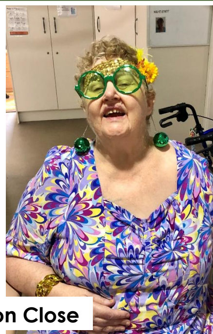
Australia day celebrations at Albion Close