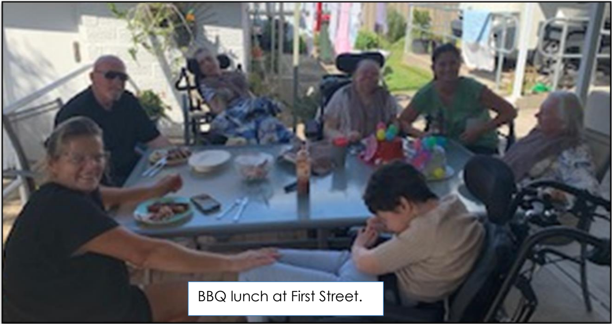
BBQ lunch at First Street.