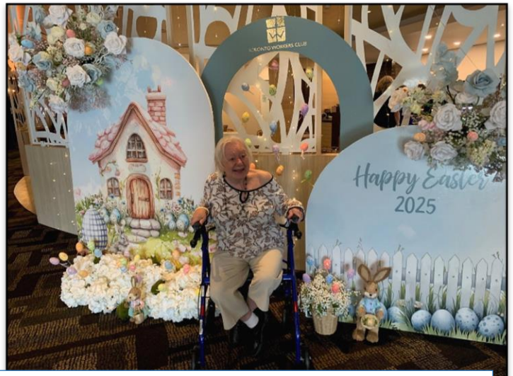
First Street Ladies outing to Toronto Workers Club for a Easter Morning Tea