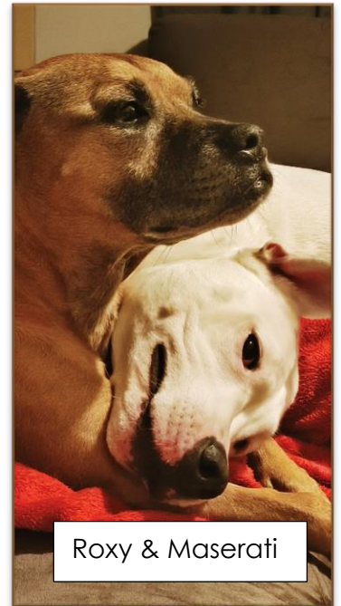
Roxy & Maserati